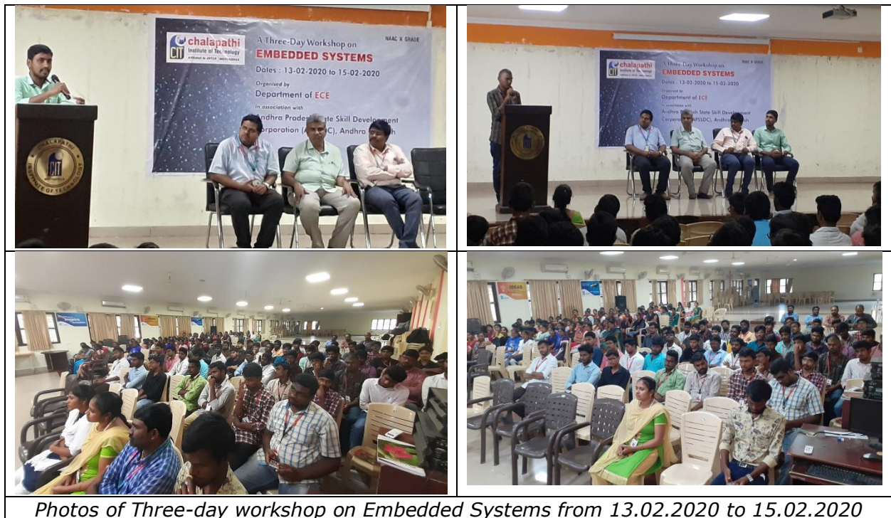
Photos of Three-day workshop on Embedded Systems from 13.02.2020 to 15.02.2020