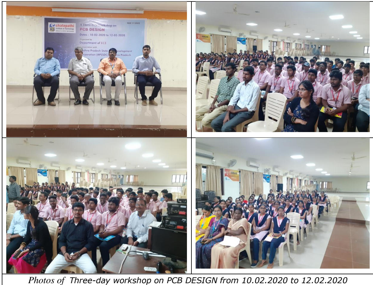
Photos of Three-day workshop on PCB DESIGN from 10.02.2020 to 12.02.2020