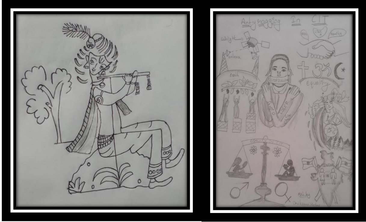
Art by Nikhila II ECE